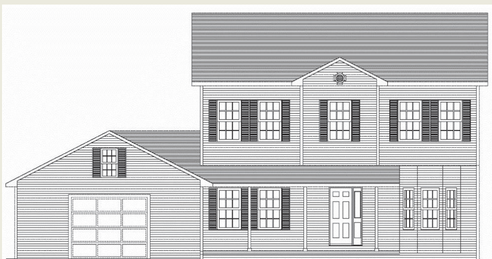
Figure 1. Traditional style elevation blueprint drawing

There are two types of blueprint drawings that are used in the construction industry that correlate to the theoretical framework of the dissertation. First, an architect must create an elevation drawing to display the exterior of the home. This drawing offers an outside view of the style and structure, as shown in Figure 1.